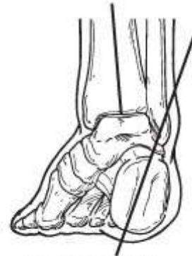
Cavus foot with high arch (rear view)