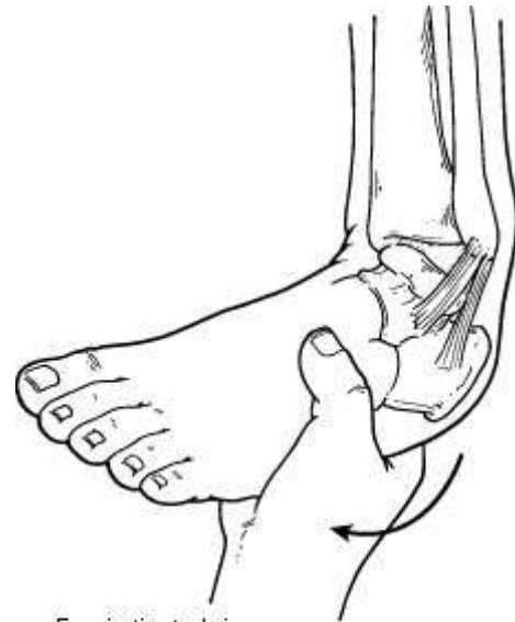
Examination technique: Chronic lateral ankle instability