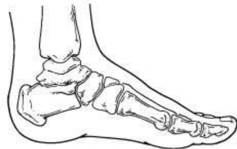
Normal pediatric foot